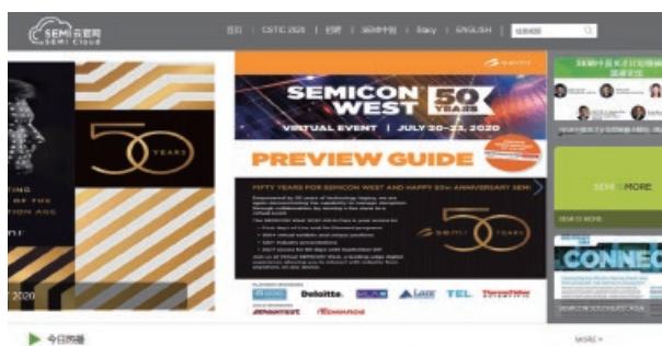
SEMI Cloud Homepage Ads