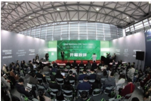
WFD CXO Forum

Ps: Some items can be replaced by negotiation.