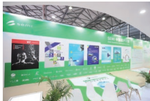
WFD Wall Ads