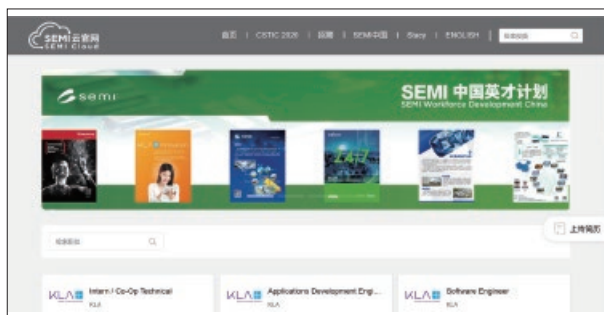
SEMI Cloud Recruiting Page Ads