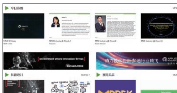
SEMI Cloud Ads