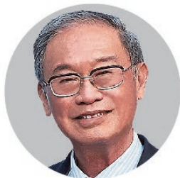
Dr. Simon M. Sze Honorary Chair Professor NCTU