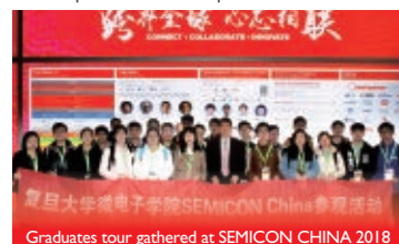
Graduates tour gathered at SEMICON CHINA 2018