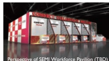
Perspective of SEMI Workforce Pavilion (TBD)