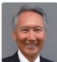
Prof. Chenming Hu FinFET Inventor Microelectronic Scientist